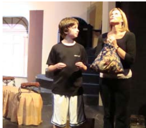
MAME cast ensuring us, as Mame does, that "Life is a Banquet."

Having played both Mame and Vera in different productions in the 70's it has been a pleasure pursuing this musical from the opposite side of the footlights. Our goal is to share with you Mame and friends lust for living. So buy your tickets now to share that lust.