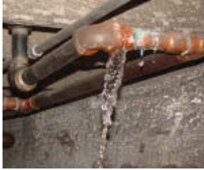
The cause of it all: Water sprays from a corroded connector in sprinkler system.

Clean up and repair work began quickly, so the Christmas musical could open on time December 2. The basement still was unusable, but with water and heat turned back on, the rest of the building (including the upstairs bathroom) could function.