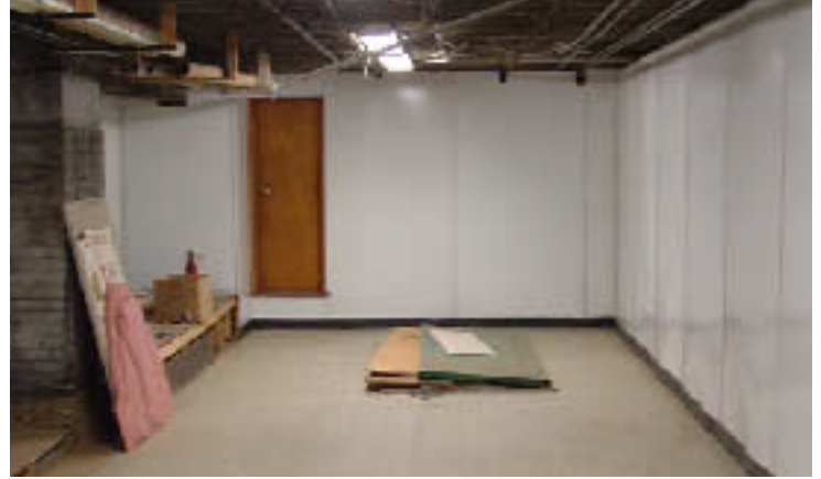
The center room – now dry, clean and empty.

With our insurance company covering the cost, a crew of hired workers attacked the muddy mess. Everything in the flooded rooms was removed – wet and muddied, into a semitruck-sized dumpster; dry and salvageable, into a large storage container parked outside. The dumpster was emptied three times. Workers shoveled mud for days. The walls in the three flooded rooms and hallway were removed, revealing the wooden studs and stone foundation.