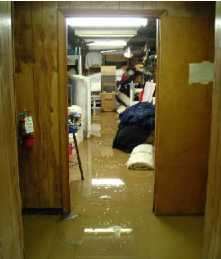
Overhead lights reflect in the muddy water standing in the basement’s center room.